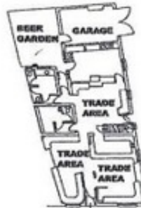
SITE PLAN 1:200 - CHECK SURVEY